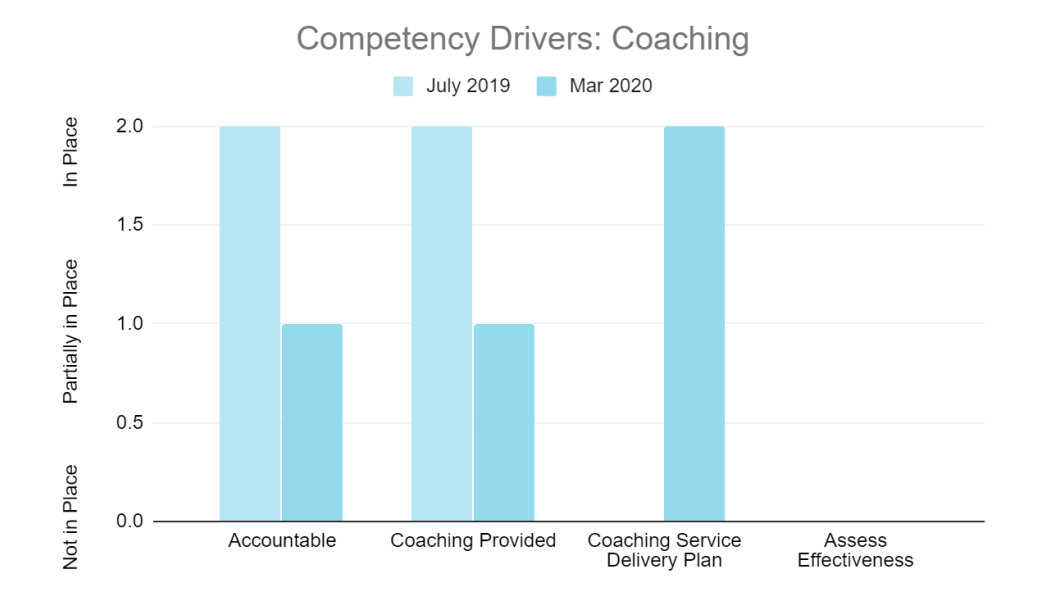
Figure 1a: Comparison of Coaching Driver scores, July 2019 and March 2020