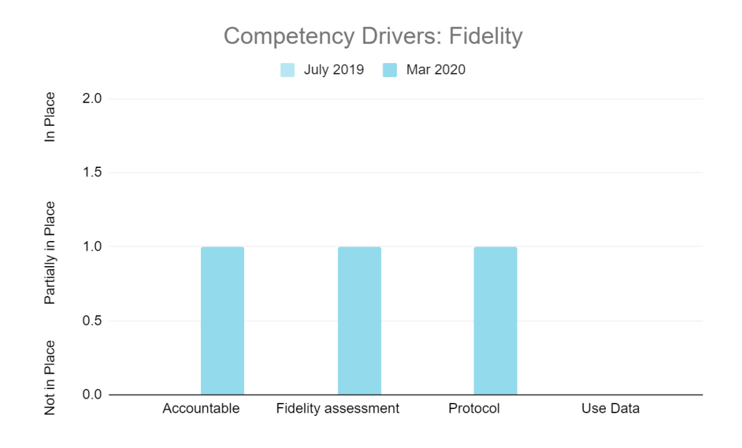
Figure 1b: Comparison of Fidelity Driver scores, July 2019 and March 2020