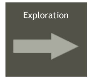
The Four Phases of Implementation--Overview

Onboard leaders Develop initial communication plan